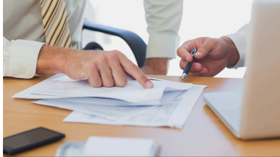
( https://www.crcgroup.com/Tools-Intel/Specialty-Tools-Intel/captives-the-es-market-how-wholesale-partners-help-fill-the-gaps )

Read Now (+) https://www.crcgroup.com/Tools-Intel/Specialty-Tools-Intel/representations-warranties-insurance-why-2026-may-be-the-moment-to-act Read Now (+) https://www.crcgroup.com/Tools-Intel/Specialty-Tools-Intel/captives-the-es-market-how-wholesale-partners-help-fill-the-gaps