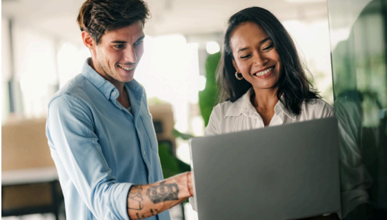
( https://www.crcgroup.com/Tools-Intel/Specialty-Tools-Intel/representations-warranties-insurance-why-2026-may-be-the-moment-to-act )

Read Now (+) https://www.crcgroup.com/Tools-Intel/Specialty-Tools-Intel/ai-ready-property-coverage-insuring-the-next-generation-of-high-density-data-centers Read Now (+) https://www.crcgroup.com/Tools-Intel/Specialty-Tools-Intel/tria-at-a-crossroads-pending-changes-and-their-potential-impact